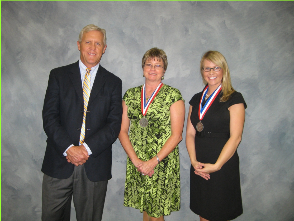
St. Joseph receiving National Medal of Honor for Organ Donation