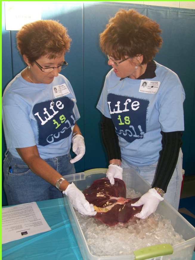
Critical Care Directors at Liver Station