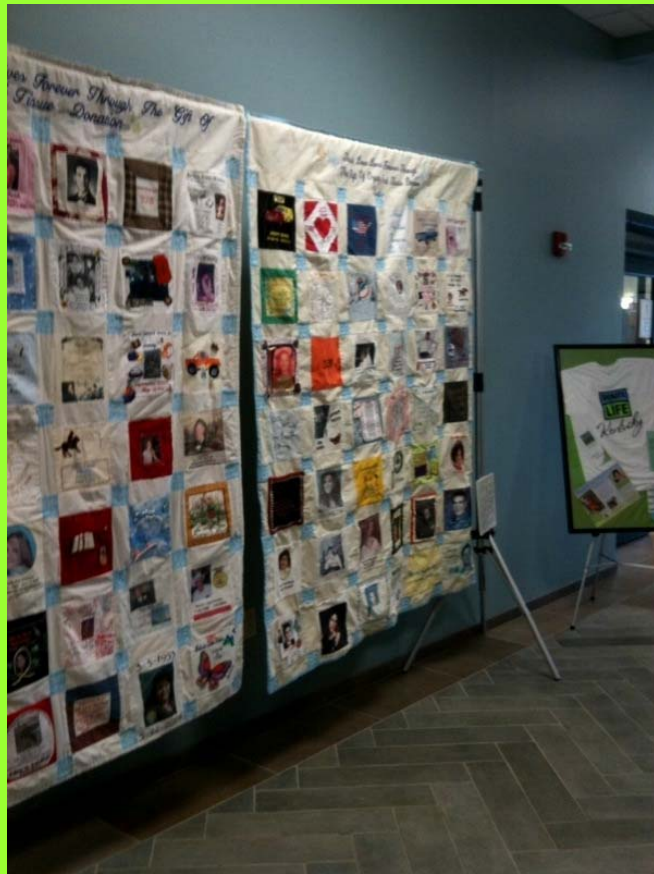
Quilts on Display in Library