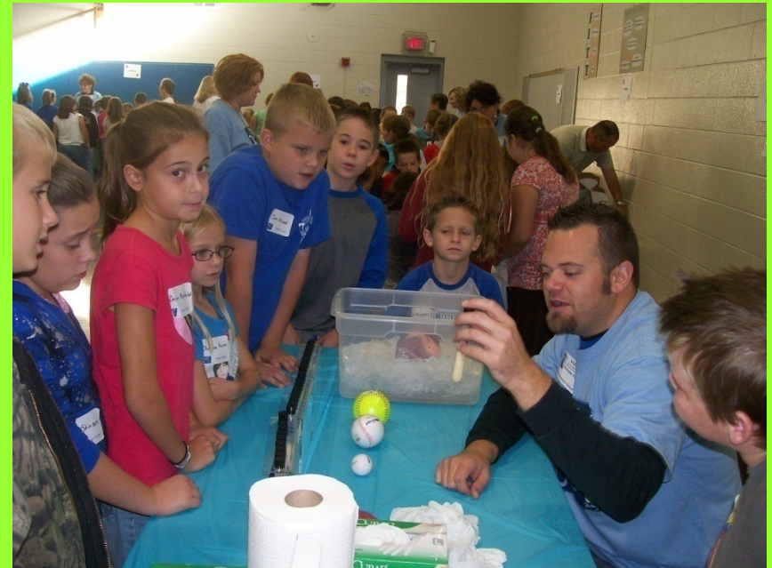
Critical Care Nurse at Heart Station