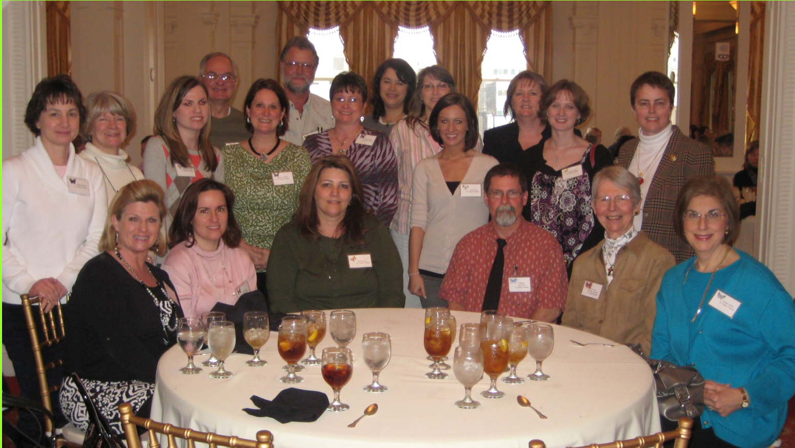
St. Joseph Staff at annual KODA conference